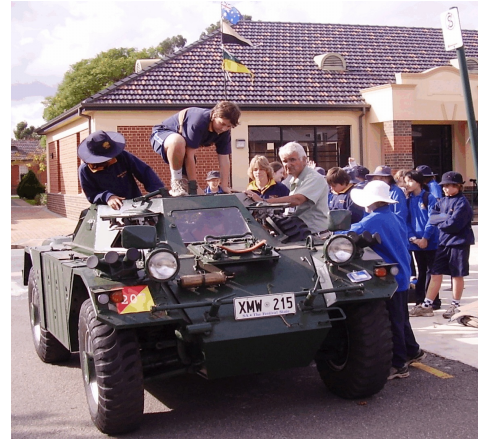
Exploring the 'Ferret'