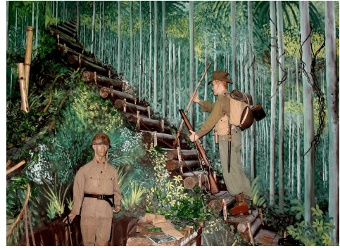
The Golden Stairs Kokoda Track