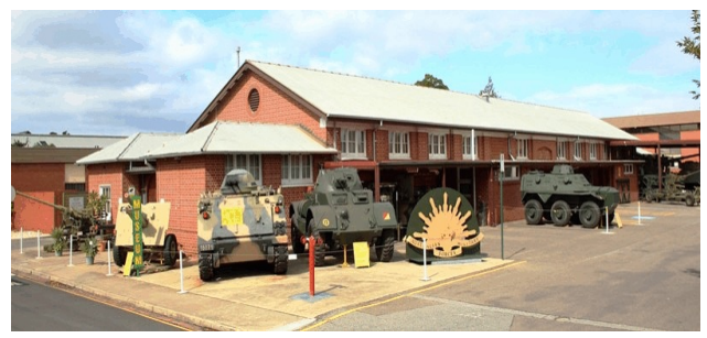
Museum exterior display