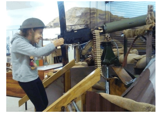
WWI Vickers machine gun