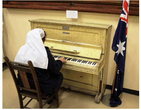
Cheer Up Hut piano covered in signatures of visiting servicemen