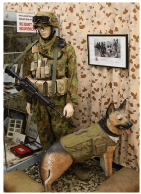
On patrol in Afghanistan