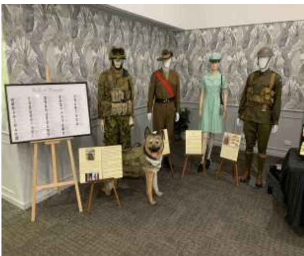
View of display mannequins and Vietnam Roll of Honour

The Defence Members and Families Support (DMFS) organisation annually hold a 'Welcome to SA' twilight event at the Adelaide Zoo to welcome all Regular Force newly-posted families to the state. All defence related support organisations are invited to set up a table or stall. It is a good night for both Defence families and stallholders to engage with each other and be aware of the various services available. For the second year running, AMOSA was invited to set up a display on 9 February for this event. As we had done this event before, layout and setting up was very similar to previous and went smoothly.