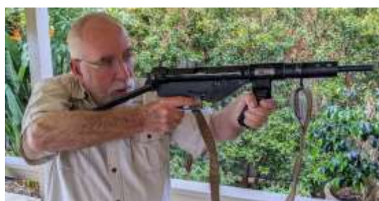
AUSTEN Mk 1 aimed from the shoulder. Note the long reach necessary to cock the weapon.

The cocking handle slot ran the whole length of the receiver and allowed dirt and other debris to easily enter the working parts.