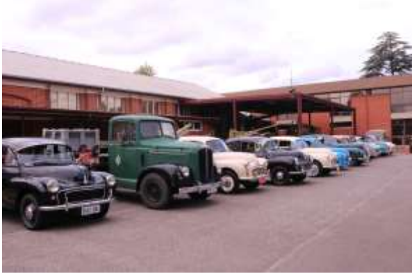
Right dressing the vehicles

After parking and 'right dressing' the vehicles in perfect alignment the 26 members were given a brief and history