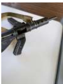
The magazine housing and front pistol grip assembly of the Austen, produced by the die casting process.

Parts of the Austen, (the magazine housing and front pistol grip assembly), were produced by the die casting process by which molten metal is forcibly injected into a mould. The rest of the weapon was constructed of pressed and welded steel. As an improvement on the Sten gun, the Austen was a failure. As well as the failings described above, it suffered production delays with both companies, and was more expensive in both cost and man hours.