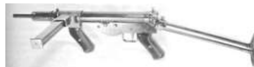
An Austen Mark 1 submachine gun