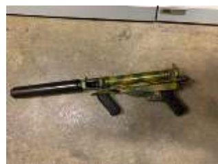
Supressed AUSTEN sub machine gun. Almost all AUSTENS were spray painted in camouflage

1942 onwards, followed by 200 Mk2s which were never issued. There was also a suppressed version which was used by Z Force commandos.