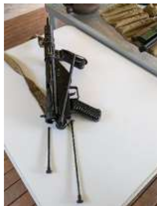
Over engineered? The Austen incorporated a screw driver and cleaning rod in the struts of the folding stock.

*These weapons were referred to as machine carbines when originally produced, but the Infantry Small Arms Training Manual of 1943 refers to them as submachine guns.