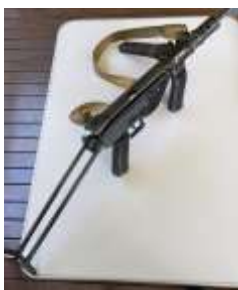
AUSTEN Sub-machine Gun Mark 1 (Author's collection)

known is the AUSTEN submachine gun, (top of picture), which served alongside the Owen, albeit for a shorter period. The name derives from AUSTRALIAN STEN, and was an attempt to improve the British Sten gun by incorporating the best features of that weapon and the German MP38/40. The weapon combined the barrel, trigger assembly and magazine of the Sten, (these were interchangeable with the Sten), and the telescoping return spring cover, pistol grips and folding stock of the MP38/40.