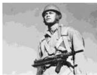
Australian para-trooper with AUSTEN gun. Note side ejection port and stock folded over the front pistol grip.

Unfortunately, the Thompson was also a complex weapon which required a skilled production